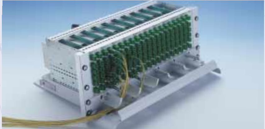
Patch field with highest packing density thanks to the combination of FIBERPORT and LX.5

The 1.7mm diameter of the connector cable allows a relieved cable management and more flexibility.