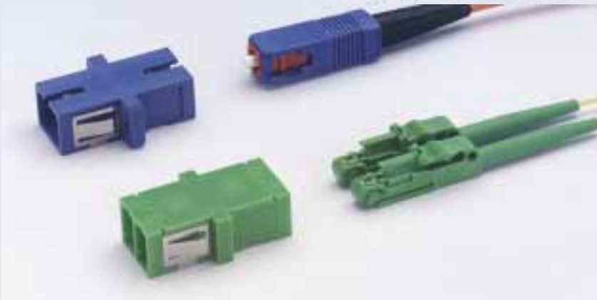
Comparison LX.5 / FSC-CMAX

The integrated latching mechanism prevents an unintentional interruption of the connection and serves as quick-lock to the adapter.